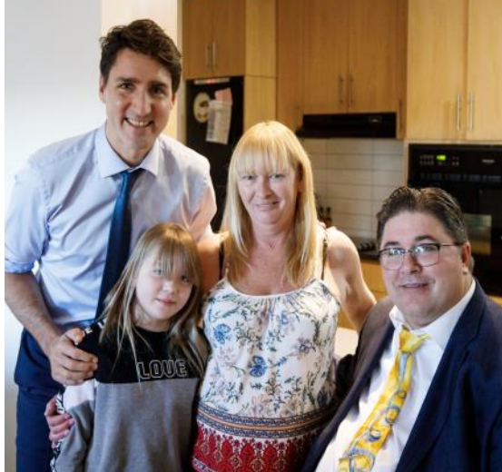
Building more affordable housing for Calgarians.

And funding local organizations like the Boys and Girls Clubs of Calgary, Kerby Centre, Horizon Housing Society, and Calgary Immigrant Women's Association.