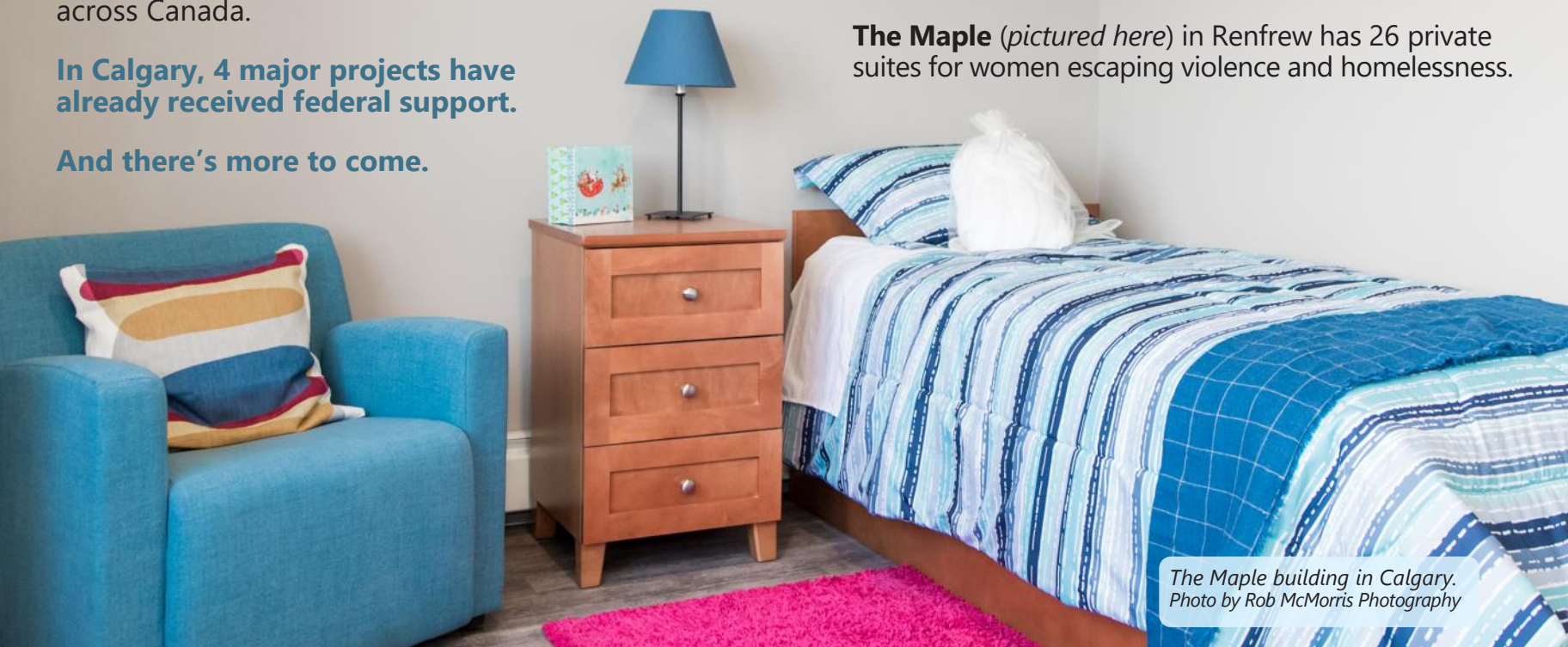
The Maple building in Calgary.

The Maple ( pictured here ) in Renfrew has 26 private suites for women escaping violence and homelessness.